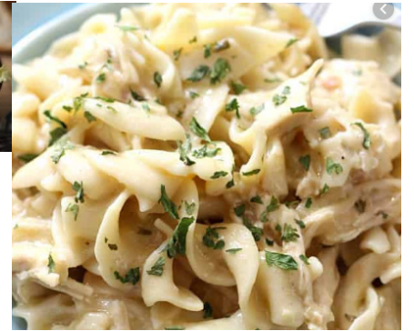
Noodle Day - Wednesday Chicken and Noodles, Salad, Bread