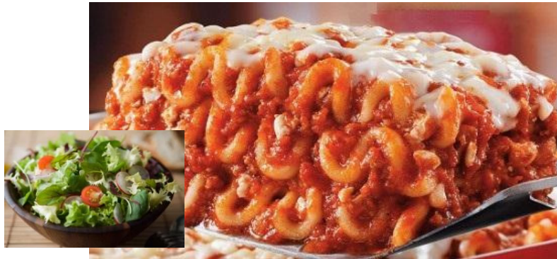
Lasagna Day - Thursday Lasagna, Salad, Bread

Mid-week Lunch Specials served at $6 per plate. Guaranteed in record time!