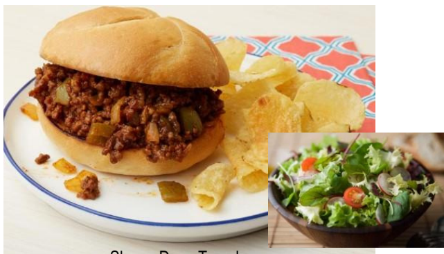
Sloppy Day - Tuesday Sloppy Joe Sandwich, Chips, Salad